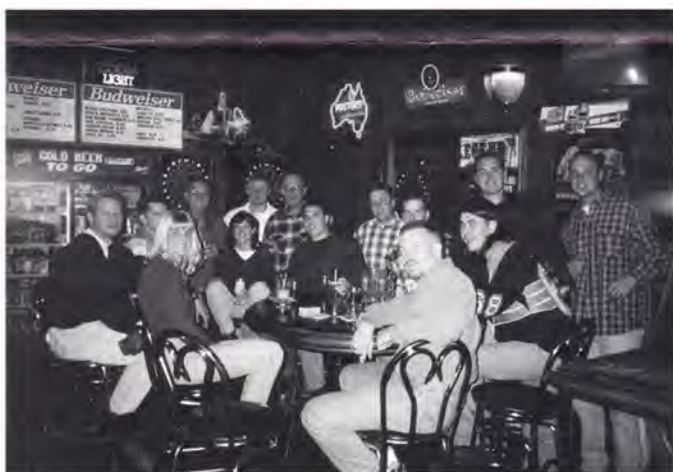
Alumni and undergrads enjoying each other's company before the Homecoming Parade.

We congratulate all of our brothers in their accomplishments and are excited to witness and be a part of the growth and prosperity of our chapter in the future.