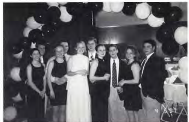
Undergrads and their dates at the Spring Formal.

Please use your alumni directory to stay in touch with your classmates and fraternity friends. We'd like to hear additional responses from those who used the directory to reestablish contact. Fill out and return the enclosed news form; we'll publish your reports in a future issue of the Alpha-Delta News .