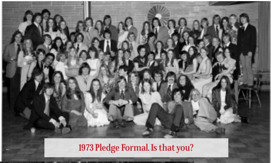
1973 Pledge Formal. Is that you?