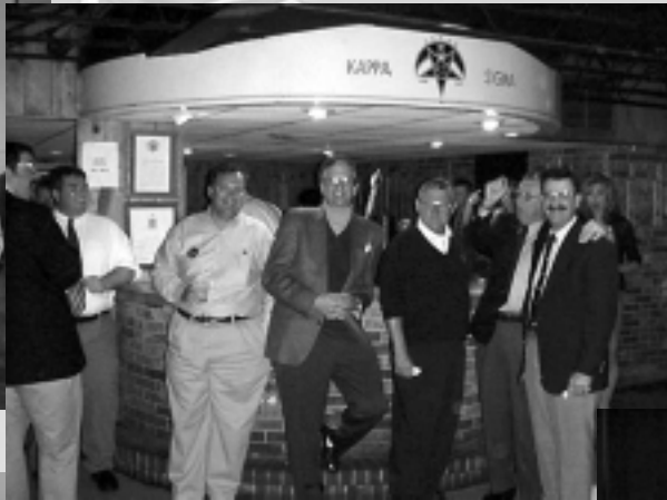
Homecoming 2001 Cocktail Party.