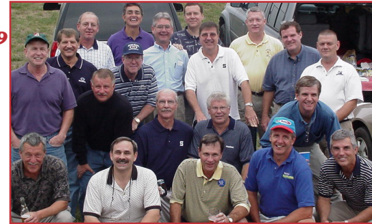
Brothers from the 1960's gather for a group photo during a Nittany Lion Home football game.