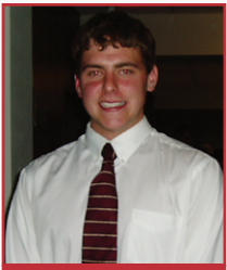
Ryan Maxwell Scholarship Winner