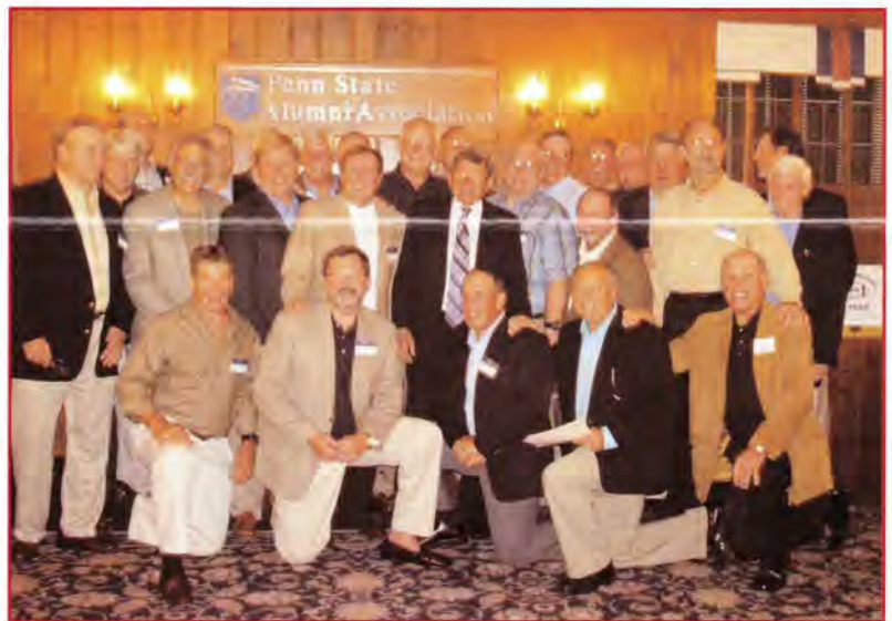
The 1966 Nittany Lion Team assembled for a reunion in 2006. Five Kappa Sigma alumni were there to celebrate Paterno's first team as head coach.