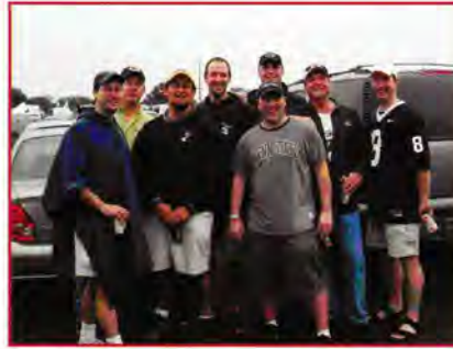
Kappa Sigma alumni from all over the U.S. met in Florida to cheer on Penn State in their Outback Bowl victory. They also took every opportunity to enjoy each other's company.