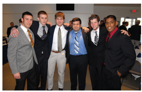
Alpha Delta's newest members.

When I decided to join the re-colonization of Kappa Sigma two years ago, I had no idea