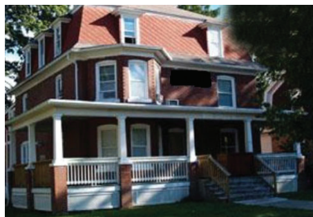
The new Kappa Sig house was the hub for many fall recruitment activities.