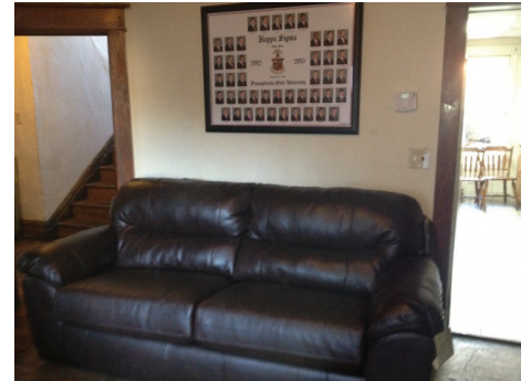
Thanks to alumni support, Alpha-Delta was able to purchase new furniture for the house.

looking into new carpets, curtains, and tables and chairs.