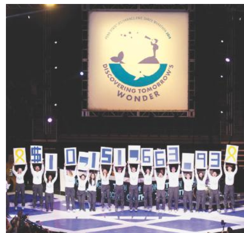
Last year's THON raised $10,151,663.93